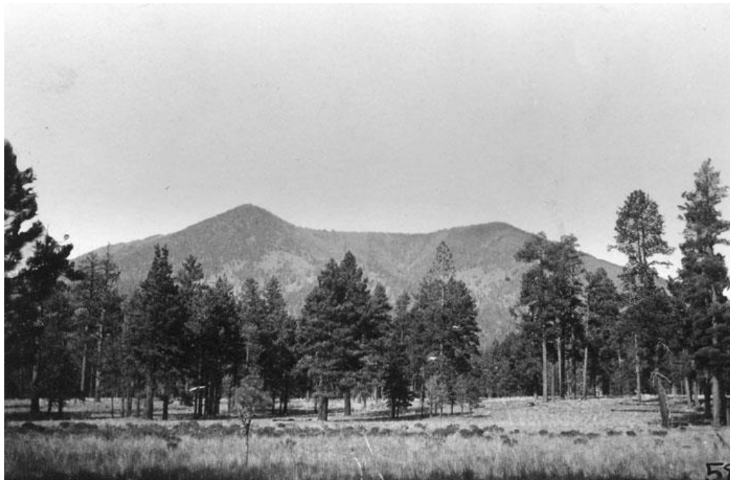
1901 Near Kendrick Mountain Shows Historical Spacing of Trees

“We came to a glorious forest of lofty pines, through which we have traveled ten miles. The country was beautifully undulating...every foot being covered with the finest grass, and beautiful broad grassy vales extending in every direction. The forest was perfectly open and unencumbered with brush wood, so that the traveling was excellent.”