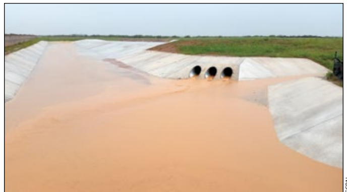
Low-profile erosion control structures retain soil and moisture.