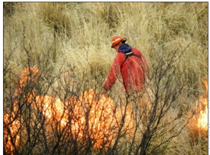
Appleton-Whittell Research Ranch